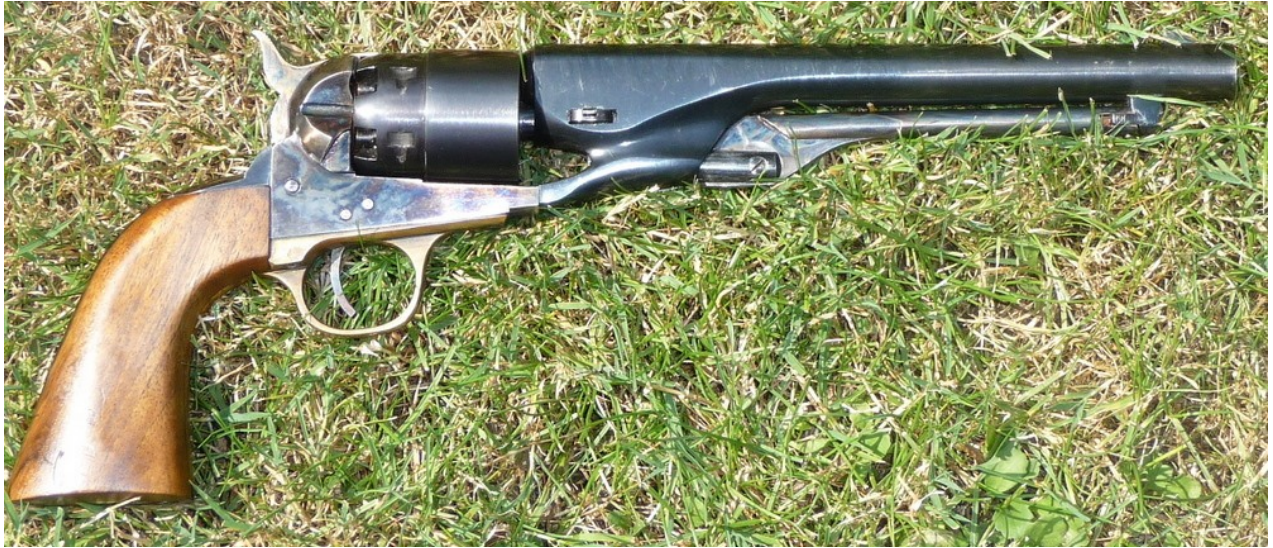
1960 CENTAURE Replica